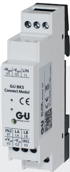
For installation in control cabinets

Have you noticed that the requirements for burglar resistance are increasing and the demand for flexible retrofit solutions is rising? The GU BKS Connect Module provides the perfect answer: tamper-proof bus communication for maximum security – with simpler faster cabling. Thanks to intelligent 2-wire technology , retrofitting of A-openers is possible where up till now only electric strikes have been used.