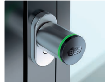
ixalo double knob cylinder | RFID