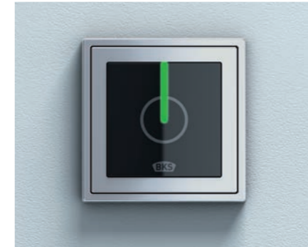
ixalo wall reader 2 | RFID

ixalo door hardware can be used in conjunction with all lever handle models of the WDL door hardware range. To meet individual requirements, many design-oriented door hardware variants can be obtained in combination with the relevant WDL lever handle series.